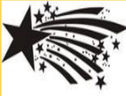
Home of the All-Stars