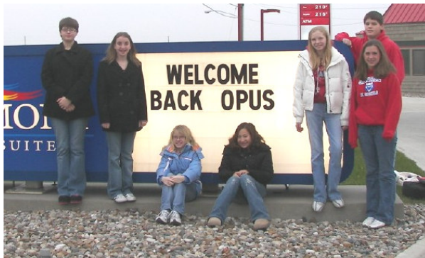
Sudlow's OPUS students are welcomed to the Baymont Hotel in Ames, Iowa.